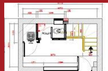
PROPOSED DETAILED GROUND FLOOR PLAN