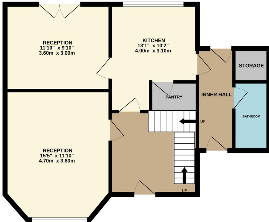
GROUND FLOOR 644 sq.ft. (59.8 sq.m.) approx.