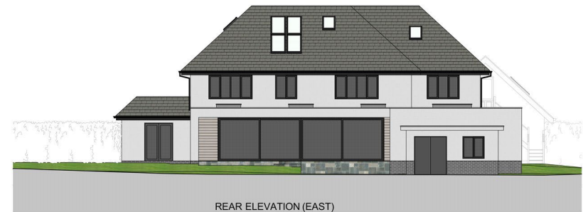
REAR ELEVATION (EAST)