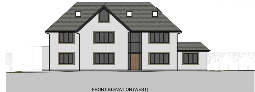
FRONT ELEVATION (WEST)