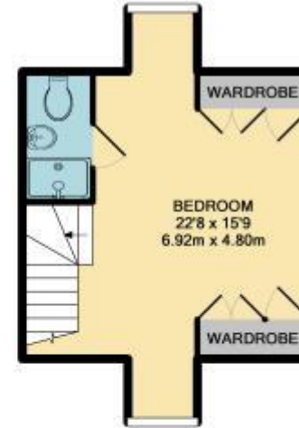
2ND FLOOR APPROX. FLOOR AREA 274 SQ.FT. (25.5 SQ.M.)

TOTAL APPROX. FLOOR AREA 1091 SQ.FT. (101.3 SQ.M.)