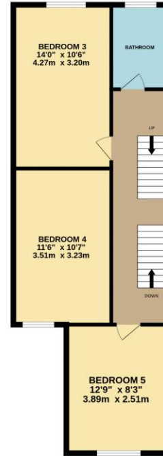
1ST FLOOR 682 sq.ft. (63.4 sq.m.) approx.