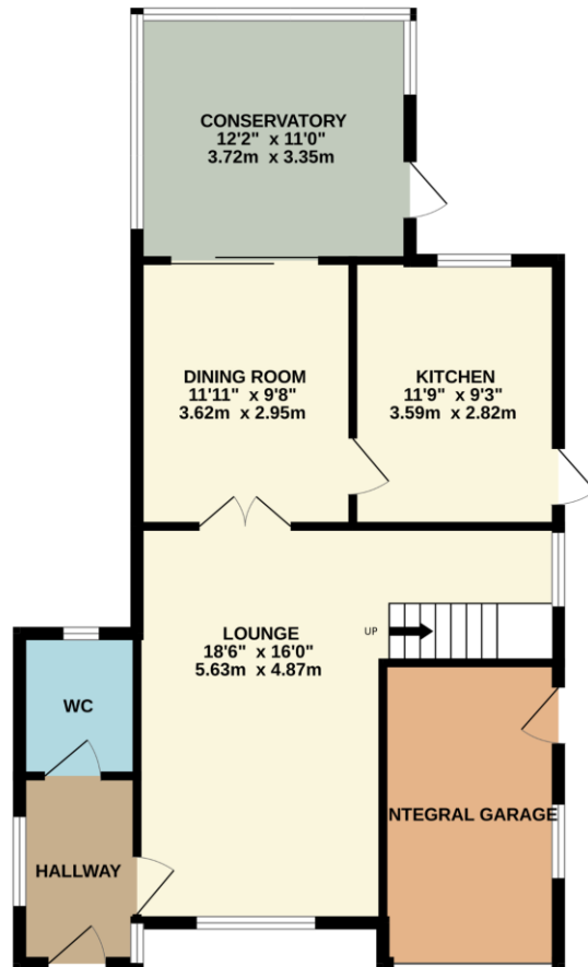
GROUND FLOOR 783 sq.ft. (72.8 sq.m.) approx.