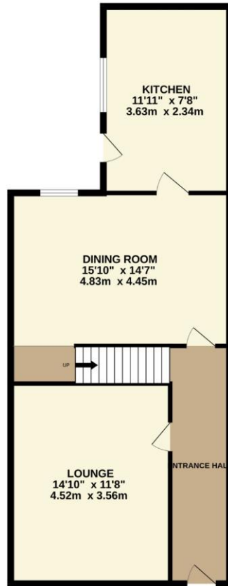
GROUND FLOOR 830 sq.ft. (77.1 sq.m.) approx.